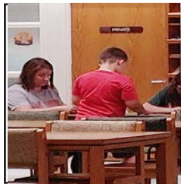
The library is a good place to relax after school, before practice, and between games.