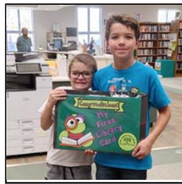
September was Library Card Sign-up month. If you don't have your library card, it's never too late. Stop by and sign up.