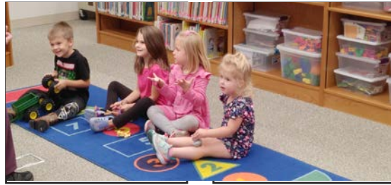
One Size Fits All Storytime meets every Wednesday at 11:30. The kids sing a few songs, hear a few stories, and do a craft. There's room for more kids.