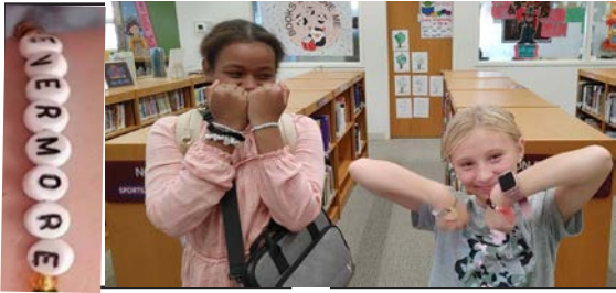
The library is the place for kids. We had Taylor Swift Week, where kids made Friendship Bracelets and blinged guitar picks