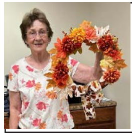
The library has so much for everyone. Adults can learn a new craft.