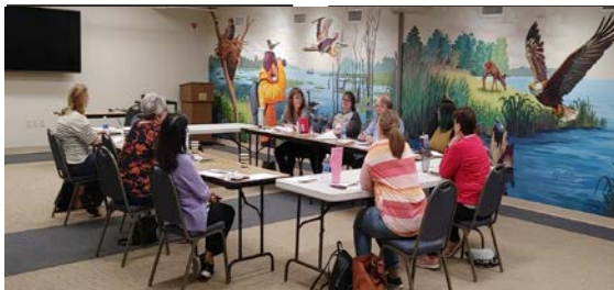
Library directors from across North-west Ohio took advantage of our large meeting room when they met for a round table.