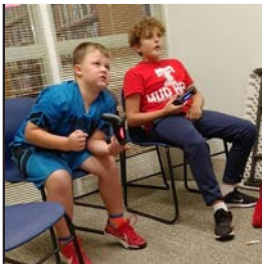
We had a PlayStation for a week, and the kids enjoyed playing games at the library.