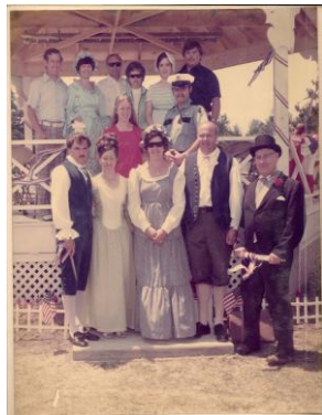
July 4, 1976

The Gazebo, built in June, 1976, was moved from Veteran's Memorial Park to Flat Iron Park on September 10, 1988. The Gazebo is prominently placed on the west end of this park and seen as soon as one enters the Village on State Route 105.